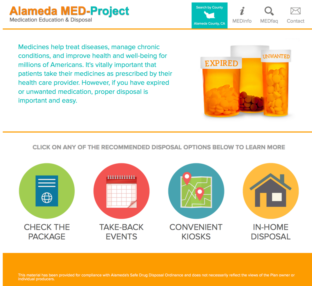
Figure 4: Alameda MED-Project Website Landing Page

Alameda MED-Project developed a robust website for the Program, which was made available on March 27, 2015 at www.med-project.org/alameda .