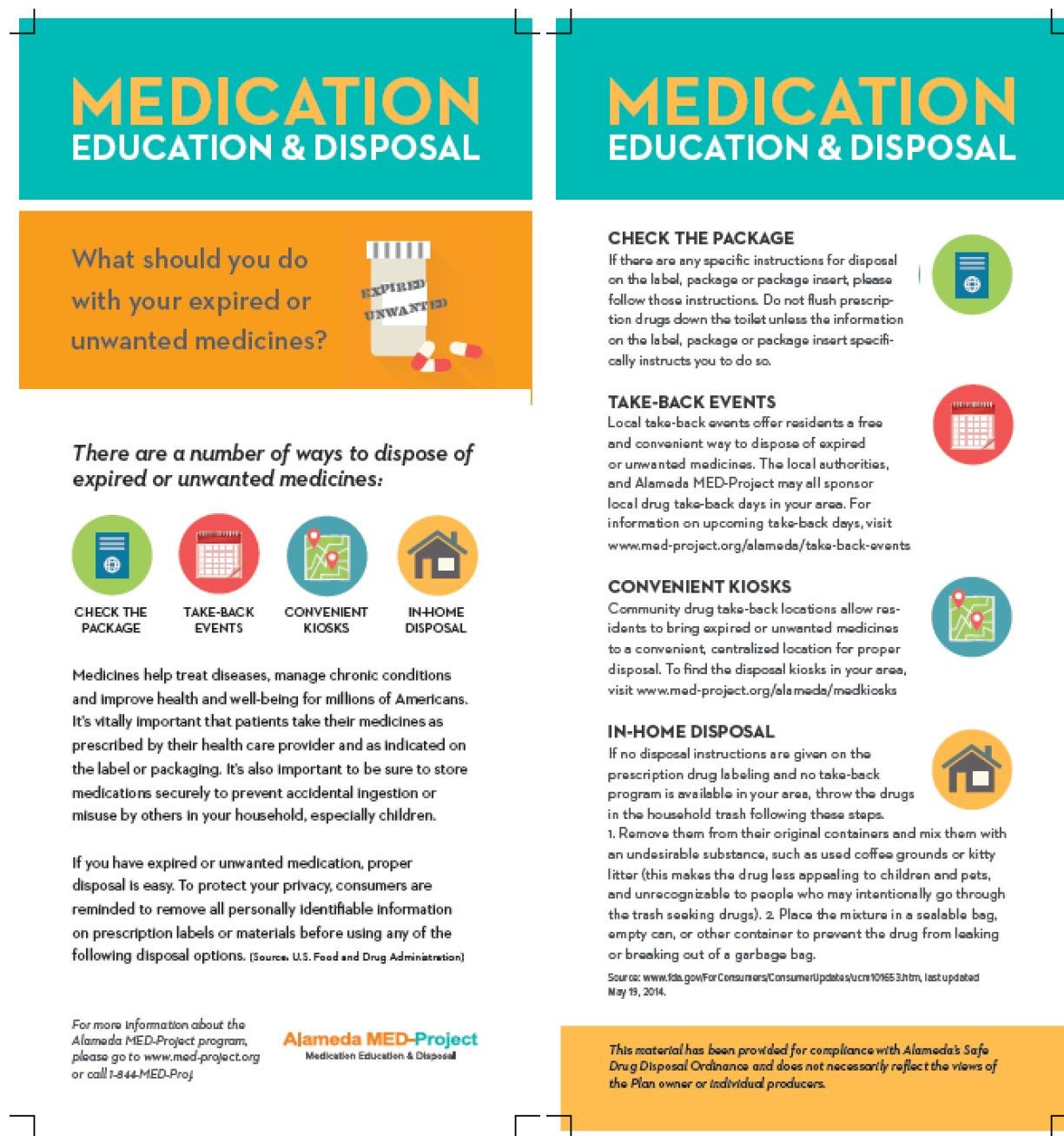
Figure 3: MED-Project Double-Sided Brochure

A primary objective of outreach efforts in 2015 was to raise awareness of the Ordinance and the new Program. In February 2016, surveys (Appendix B) were sent to all licensed pharmacies in Alameda County (Appendix C) to assess interest in participating in the Program.