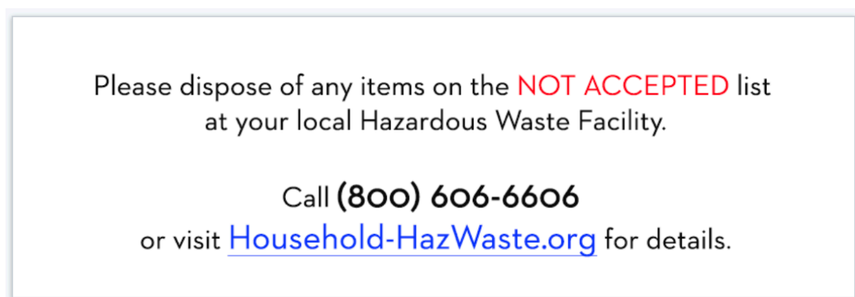
Figure 5: Signage Directing Residents to Other Disposal Options for Items that are Not Accepted in Kiosks

Kiosk collection agreements continue to be distributed to interested sites and are under review by several agencies and organizations. The location of each site and the status of the agreements are outlined in Tables 4 and 5 below.