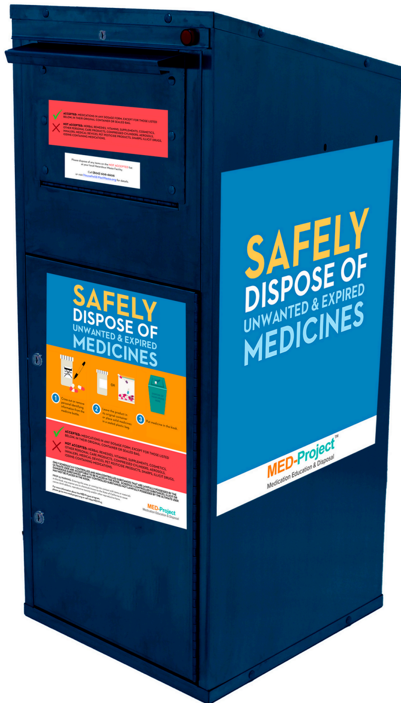
Figure 2: Mock-Up of Kiosk With Approved Signage

Updated signage describes products that are accepted and not accepted in kiosks, with additional information directing residents toward disposal options for items that are not accepted in kiosks. For more information on approved kiosk signage, please see Figures 2, 3, 4, and 5.