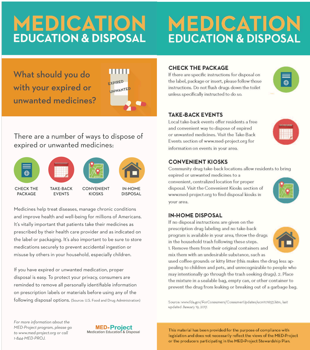
Figure 6: MED-Project Double-Sided Brochure

MED-Project developed a robust website for the Program, which was made available in 2015, and is updated periodically. The landing page for the website is at http://www.med-project.org/locations/alameda .