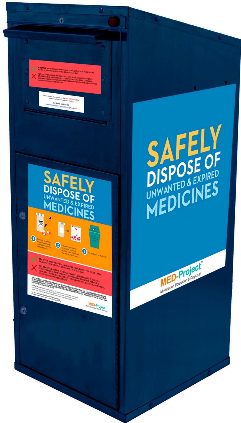
Figure 2: Mock-Up of Kiosk With Approved Signage 2