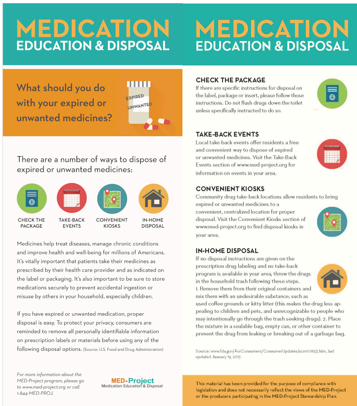
Figure 6: MED-Project Double-Sided Brochure

MED-Project hosts a robust website for the Program, which was made available in 2015, and is updated periodically. The landing page for the website is located at http://www.med-project.org/locations/alameda .